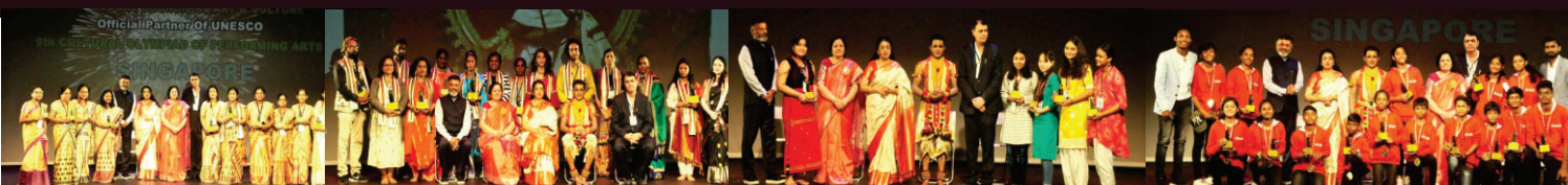
ABSS GROUP OF 9TH CULTURAL OLYMPIAD-SINGAPORE-2019